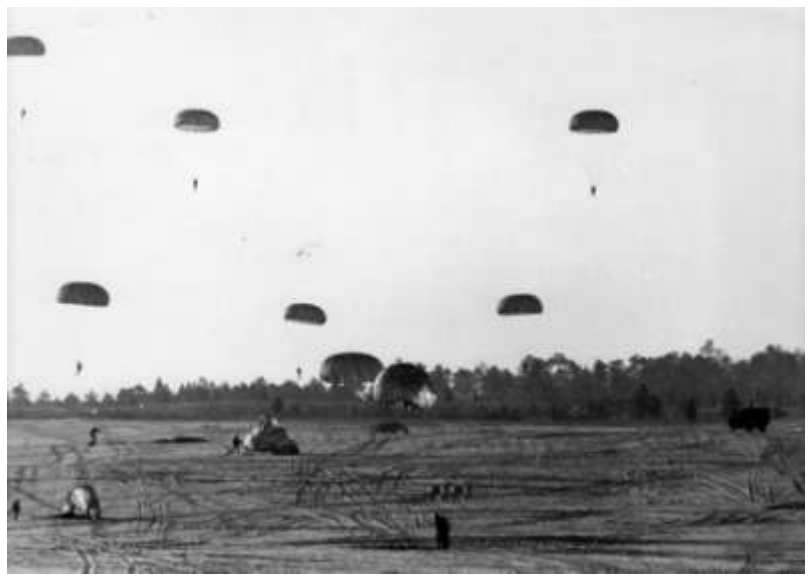
Special Forces medical class 67-1, Fort Bragg NC

good airplanes as part of their training. Thirdly, they had to volunteer for Special Forces. The volunteering part done, there was a long period of testing, qualifying and training before these young men could wear the Green Beret. Once awarded the beret, there remained a lot more training in a job specialty and in other areas such as jungle warfare and survival training. In the end, these few, these Green Berets, were the boys next door now grown into men of honor and dignity, highly trained and motivated to go wherever their Country would send them.